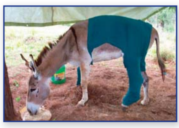
Donkey with Broken Leg

lage gave their hearts to Jesus. After the baptism, four young men expressed a desire to raise a church in their home village. Touched by their selfless ambition, our Bible workers and teachers promised to help. They