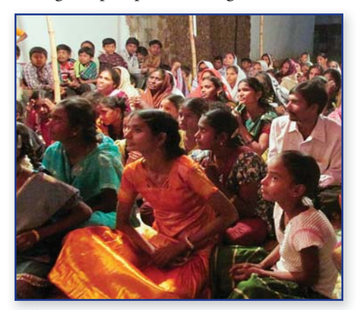
India Learns Christmas Story

to work for a while. It is difficult to make enough money to provide the food they need and they are afraid to trust God to meet their needs. Not so in Pondulu Paka, they keep the Sabbath holy; however, there isn't a church building to meet in. They meet in the church elder's home. A large tarp is put on the ground for ev-