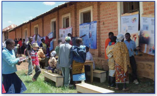
LIGHT Comes to Mago School

In October, a team from America came to Eden Valley Foster Care Mission in Tanzania; and in two weeks, they built our hydroelectric power plant and kitchen cupboards. It was a huge undertaking. They dug ditches, constructed the power plant, the battery house, and built the third build-