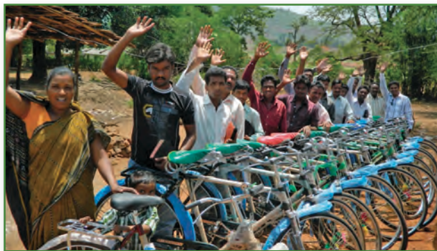
Bicycles presented to rural pastors in India

There are many areas in India where no public transportation exists. Many of our pastors go from village to village on foot, wasting precious time. They find it difficult to travel from one church to another on Sabbath, and to attend the mid-week prayer meetings. As the number of churches increase, there is a greater need for more bicycles.