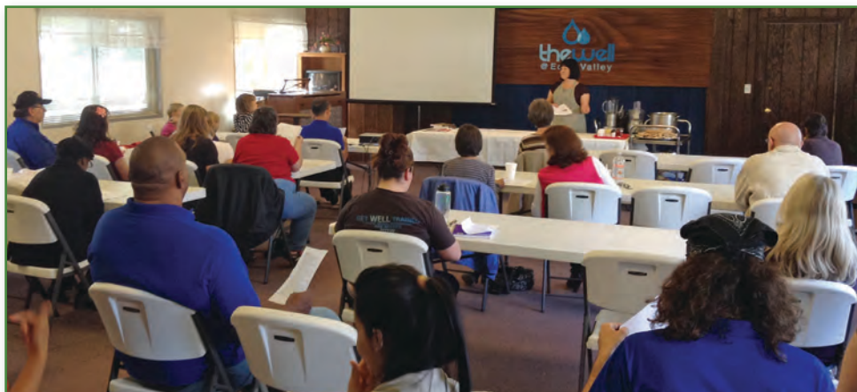
First Night of Cooking School