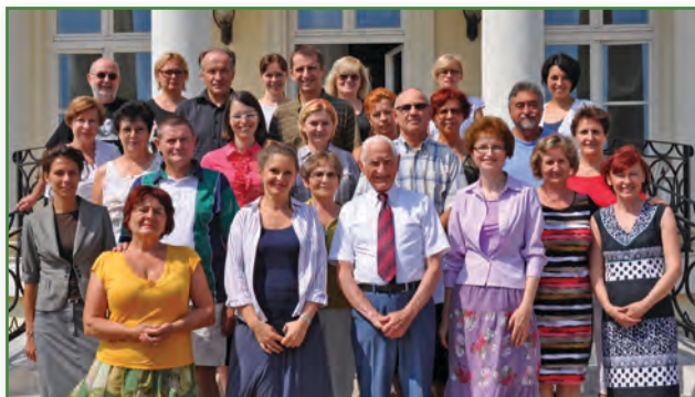
NEWSTART Poland guests