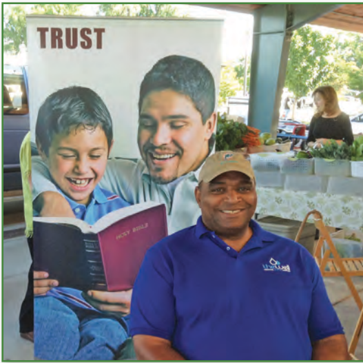
Health Expo Booth