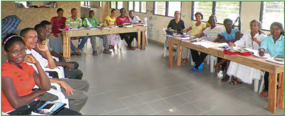
Students in the Health Evangelism Course

The children of Israel entertained the Satan-inspired-thought that Moses led them to die in the wilderness instead of in Egypt. Because the Israelites were stressed,