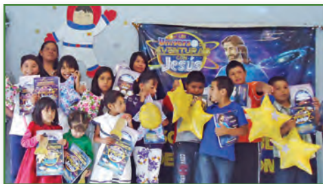
VBS in San Rafael

We enjoyed sharing Bible stories, experiments and a variety of crafts with the children. This was a special time because not only did children attend, but their parents also. Everyone participated in each activity, whether in games, crafts, or stories. In the end, both young and old were given a diploma of recognition for their participation