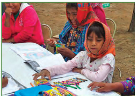
VBS in Nacarare

Three Vacation Bible Schools in Mexico Continued from pg. 7