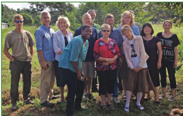
Eden Valley and Oak Haven group saying good-bye

Going forward does not mean the way will be smooth, but when we know God leads us forward, in spite of mountains, seas, hardship, and apparent impossibilities; we can move forward. "The path of toil appointed to the Christian on earth may be