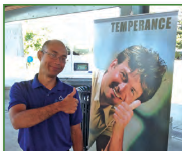
Health Expo Booth

At the beginning of their training, the students go into the community two-by-two. They knock on each door inviting the public to participate in a health study called “Eight Weeks to Wellness”. One day, the students entered a cluster of apartments. What happened next was something only the Lord could organize. The door opened; not a single door, but the door to the entire complex. With God given wisdom, the students talked to the manager