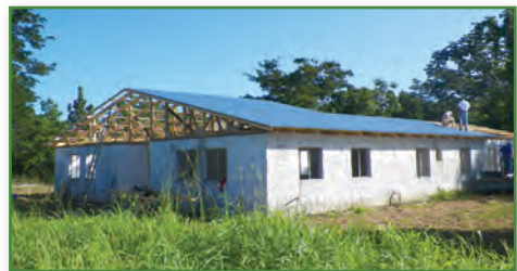
Re-roofing men's dormitory

• The students didn't have their full tuition paid.