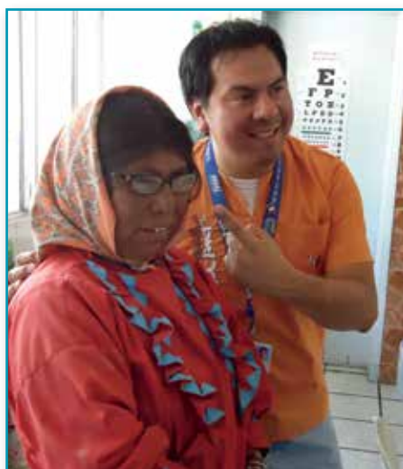
New eyeglass for a lucky lady.

Four doctors came to provide medicines, dentistry and ophthalmology free of charge in the districts of Choguita, Basihuare, Sisoguichi, San Luis de Majimachi, Creel and Bocoyna.