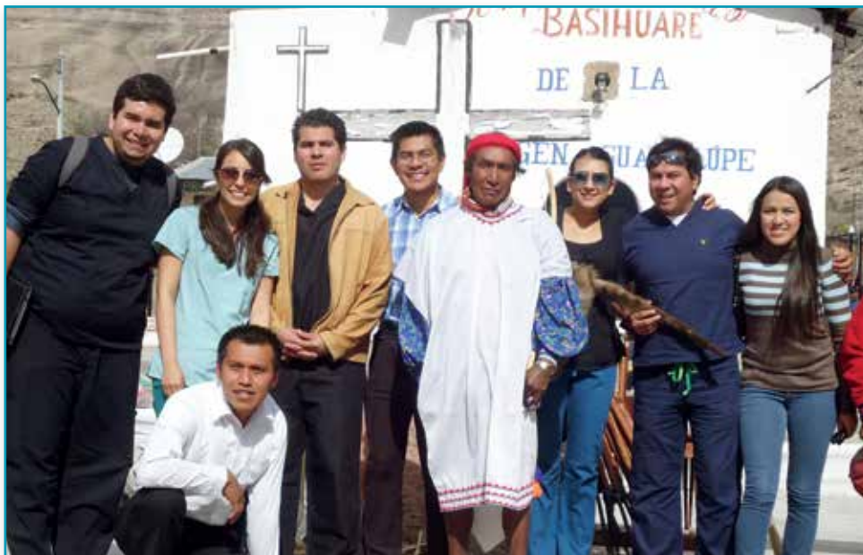
Volunteer doctors from the Adventist University Hospital of La Carlota de Montemorelos.

To all, we send our best affections; may God's blessings and peace overwhelm you daily.