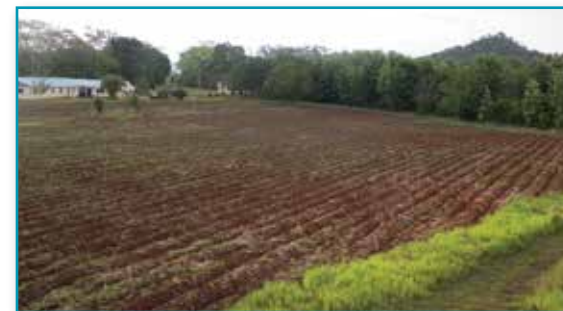
Tilling the soil to plant crops for the upcoming six month training school.

A few minutes later, I was smiling, almost laughing. "Why is he laughing?" asked a couple of officers. They couldn't know I was talking with the Lord about the accident.