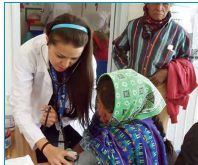
A physician taking a blood pressure among the indigenous people.

Four doctors came to provide medicines, dentistry and ophthalmology free of charge in the districts of Choguita, Basihuare, Sisoguichi, San Luis