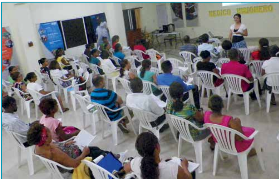
One month LIGHT school in Cambita in the Central SDA Conference.

Every day the Lord pours His grace into our lives. Over and over we are made to see the difference between those who are blessed by God and those that regard Him not. People who Share God's blessings