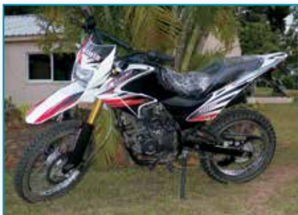
One of two motorcycles that were donated to our project.

In February, we made preparations for our first One-Month LIGHT School in the city of San Cristobal. On the 30th of March we opened our school to 70 students in an area called Cambita, in the Central S.D.A. Conference. How exciting for us. Our Campus is located in the South East S.D.A. Conference, and now we are opening doors in another field. When school lets out on April 27th, we will return to our South East S.D.A. Conference for another One-Month LIGHT School.