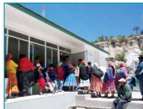
People lining up to receive free medical, dental, and eye care.

Thank God for having called us from darkness into his marvelous light. ■